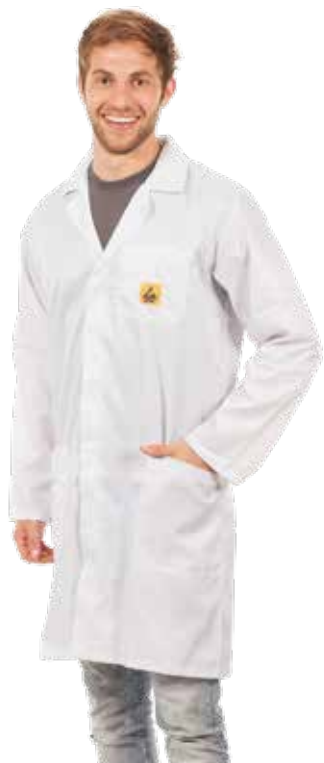
SMOCK AM-120 POLYESTER