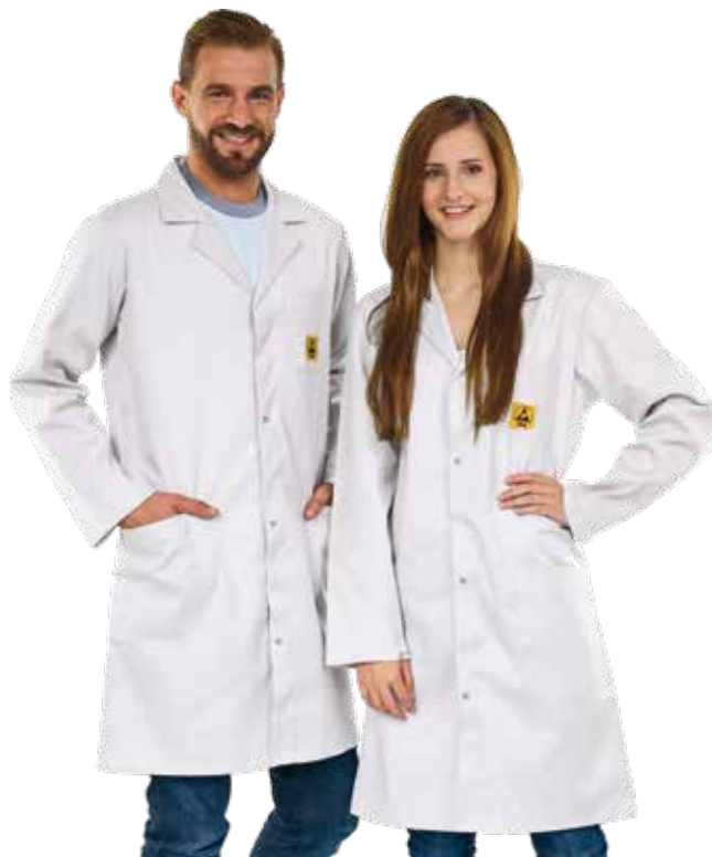
SMOCK AM-110 EXTRA LIGHT