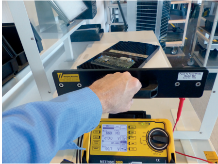
application example: measurement acrylic cover