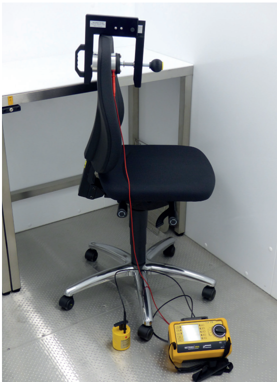
Measurement in walk-in climatic chamber