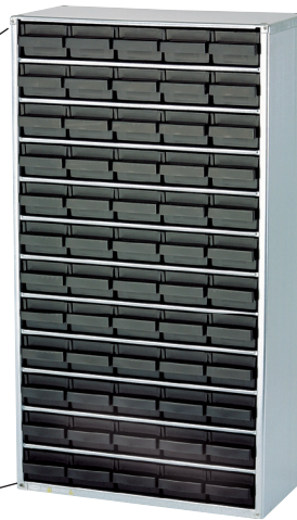
Storage rack with 60 bins.