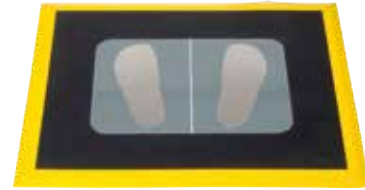
Mat for footwear electrode Dimension: 830 x 680 x 13 mm Delivered without footwear electrode