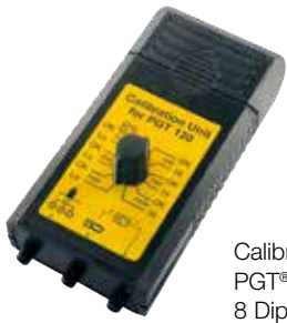
Calibration Unit for PGT®120 with 8 Dip switches