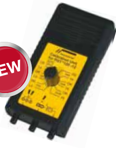
Calibration Unit for PGT®120 with 12 Dip switches